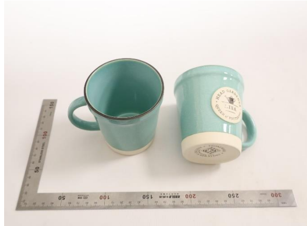
M007, M008, M012