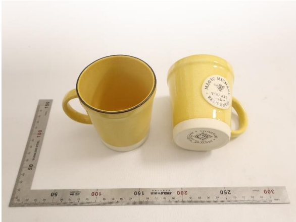
M005, M006, M011