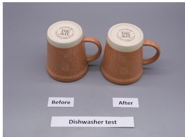
E01-2 Bottom view (No changes)