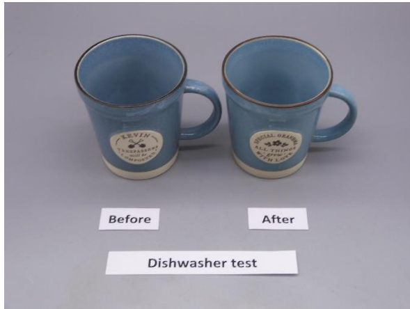
E02-1 Top veiw (No changes)