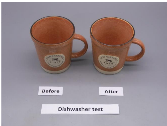
E01-1 Top view (No changes)