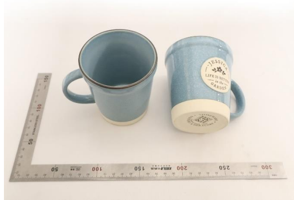
M003, M004, M010