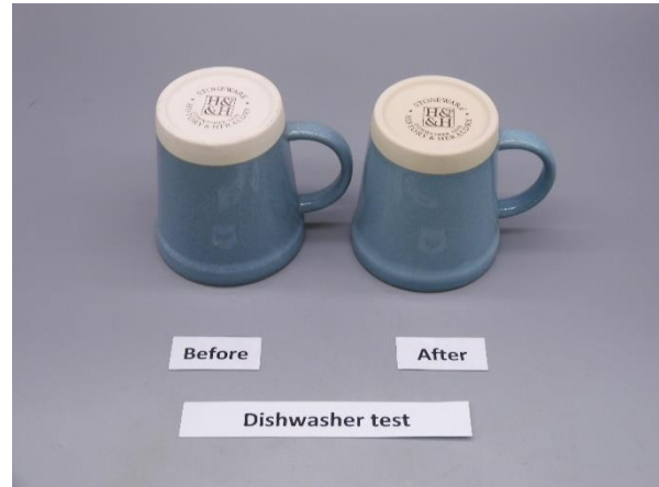
E02-2 Bottom view (No changes)