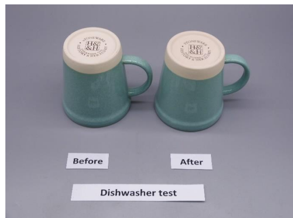
E04-2 Bottom view (No changes)