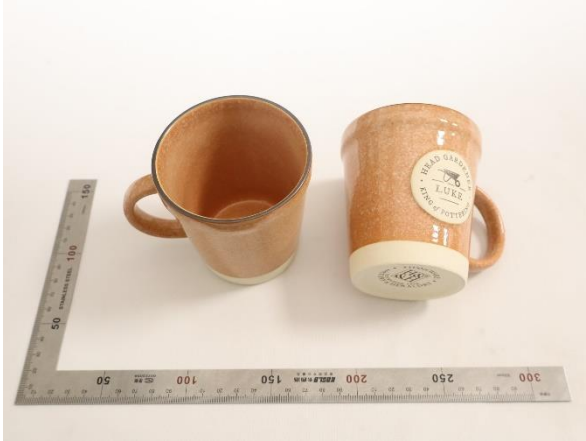
M001, M002, M009