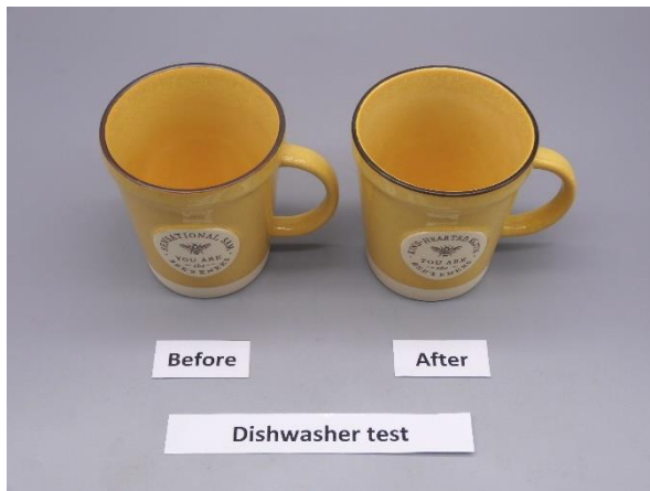
E03-1 Top veiw (No changes)