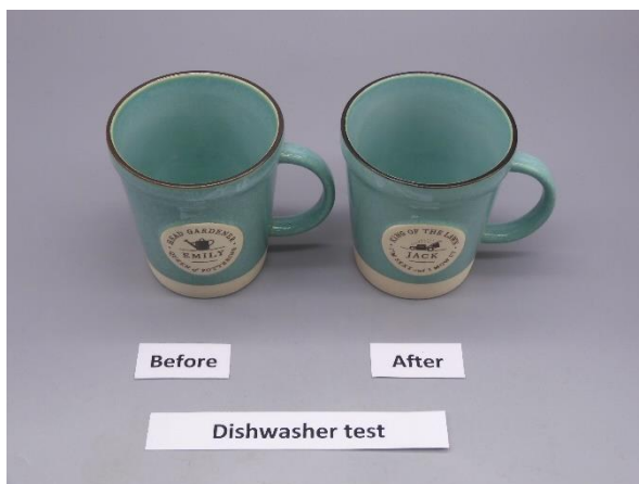
E04-1 Top veiw (No changes)